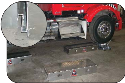
Runway Sections are connected with locking channels that allow individual sections to be quickly removed for easy access under the vehicle.