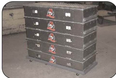
Sections snap-lock together and can be easily transported with the 402620 cart.