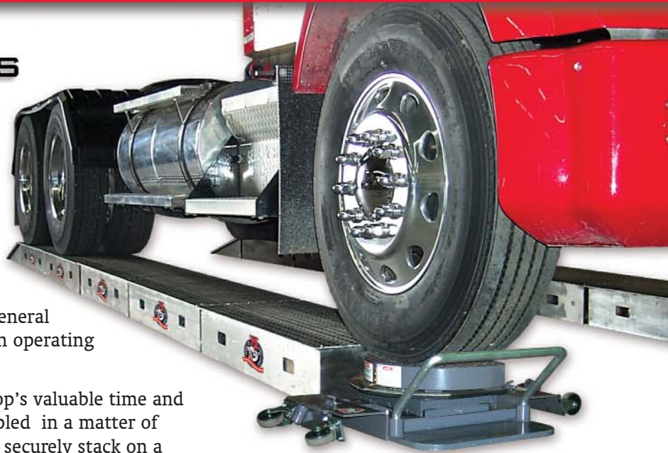
The new 29540P Low Profile KPI Turning Aligners feature transport wheels that collapse to produce a stable turn plate.

When Runways are used with the Bee Line 7600 Floor Jack and the 29540P Low Profile Kingpin Turning Aligners, all alignment measurements can be taken including runout, toe, camber, caster, steering stops, turnout on turns and KPI. Toe can easily be adjusted with the vehicle on the runways.