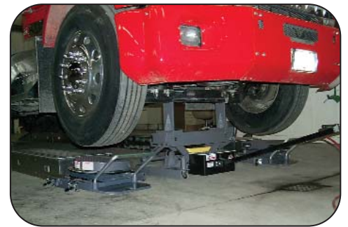
The new Bee Line 7600 Floor Jack securely lifts the vehicles front end while taking runout measurements.

Portable runways are ideal for use with Bee Line's Drive Over Frame Press. After the the press raises the vehicle, runway sections can be removed and stacked to keep the vehicle elevated while frame adjustments are being performed. Cab corrections can also be made by utilizing the Bee Line Power Tower.